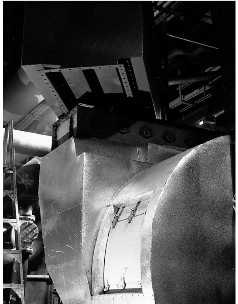
Retrofit heavy duty fan silencer is squeezed into position. This difficult retrofit proves once again that it is less costly and troublesome to provide the necessary silencing for the original installation.

The silencer was designed to have substantial thickness of acoustic media totally external to the connection size. This effectively reduced the fan silencer internal velocity for the same acoustic insertion loss in the same length of five feet.