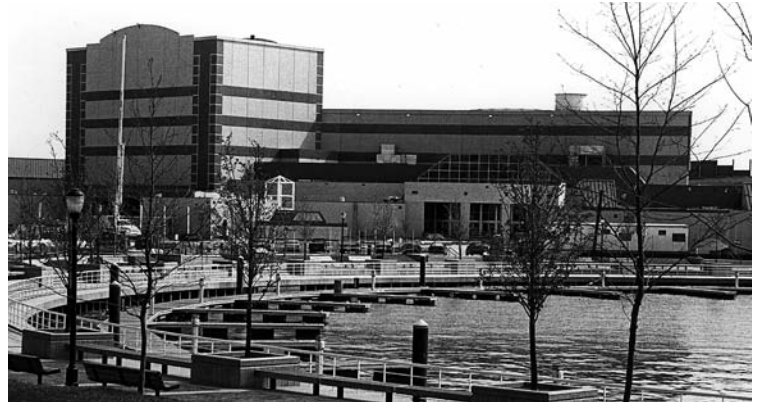
Vibro-Acoustics supplied rectangular and T-elbow silencers for this indoor/outdoor facility in Camden, New Jersey.

NOTE OF INTEREST: This unique theater is a prototype for future multi-purpose entertainment facilities and is the first indoor/outdoor facility of its kind in the U.S. Flexible design challenges were accentuated by uses ranging from 25,000 seat outdoor pop music events to 1,600 seat indoor classical concerts.