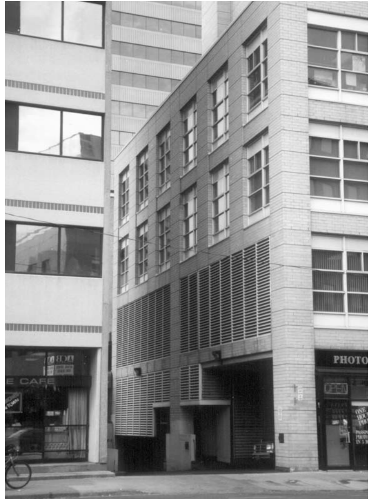
Cooling tower noise radiated from this louver to the neighbourhood and windows above.